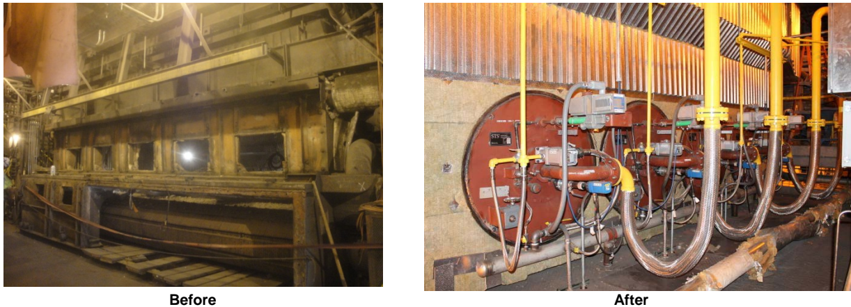
Figure 5-1. Before and After Boiler Conversion

A summary the boiler performance and emissions is provided in Table 5-1.